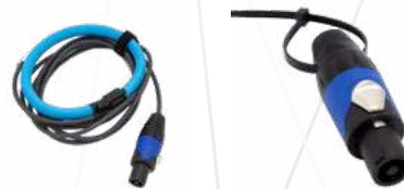
Optional CT protection