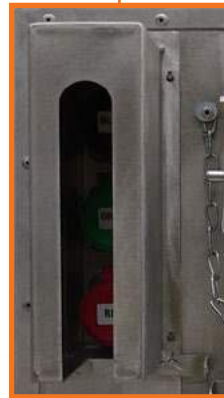
Optional cap to lock connections in place