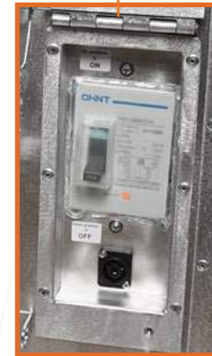
Inside view of breaker switch box