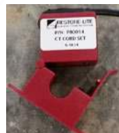
Optional CT protection