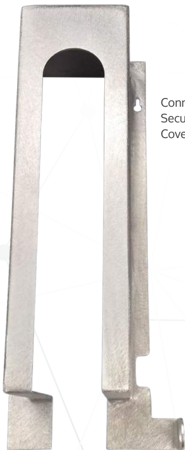
Connection Security Cover

Locking Kit secures twist lock connectors and breaker switch on RESTORE-LITE® units.