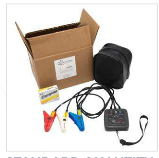
STANDARD QUANTITY PER CARTON